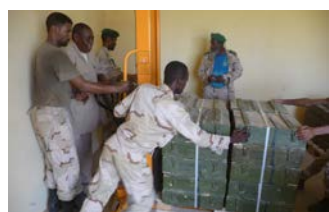
Ammunition Stockpile training by Mauritania National Army