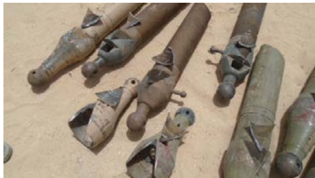
(a) Mortar systems

This first phase supported the MNA in the destruction of 82 decommissioned military ordnance and engineer vehicles, including mortar systems, light howitzers, anti-aircraft, radar vehicles and tanks. The decommissioned weapon systems have been demilitarized and dismantled in Nouakchott (70 items) and Nouadhibou (12 items).