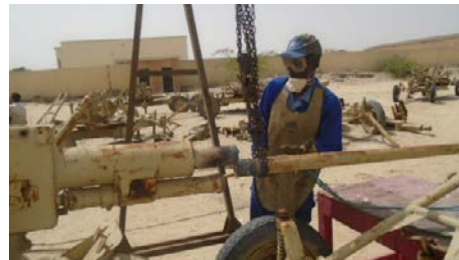
(b) Anti aircraft gun