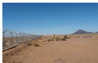
Ammunition Storage Area in F'Dérik