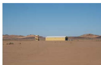
Reference Ammunition depot built in Aleg and Akjoukt