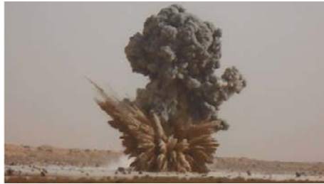
(b) Open Detonation of MANPADS and CA