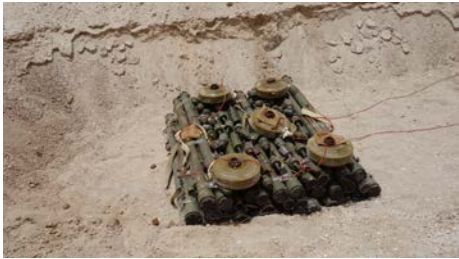
(a) MANPADS destruction

The first phase of this Trust Fund contributed to the destruction of 1,322 tonnes gross weight of obsolete and unserviceable conventional ammunition (CA) and 159 MANPADS by means of Open Burning and Open Detonation (OB/OD). The consumables were delivered during the first Mauritania Trust Fund.